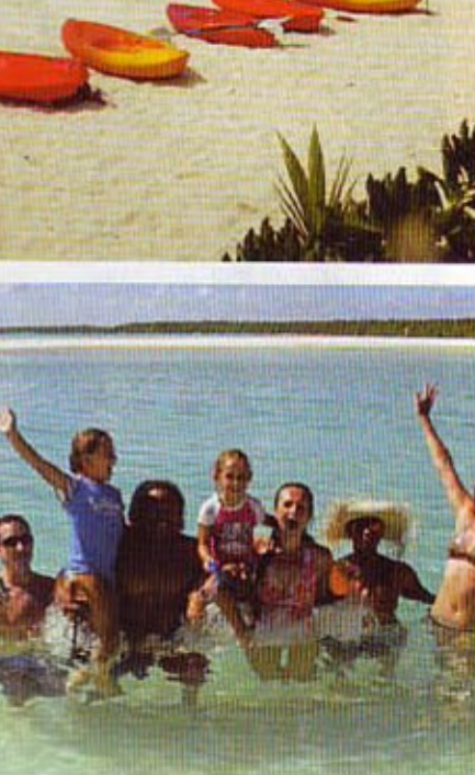
Learning about the Cook Islands culture and music.